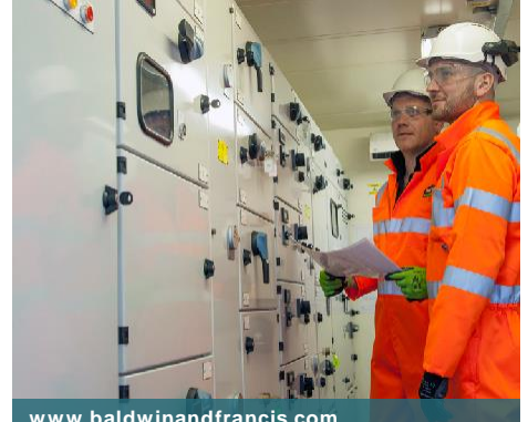
www.baldwinandfrancis.com & www.allenwest.co.uk

Pyropress is a specialist manufacturer of explosion proof switches, transmitters and valves for use in hazardous environments with a history of over 60 years of product innovation.