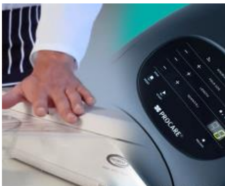
www.wrapex.com & www.hairfoil.com

Dycem is a world-leading manufacturer and supplier of branded contamination control solutions for critical environments as well as non-slip products for the physiotherapist and assisted living markets worldwide.